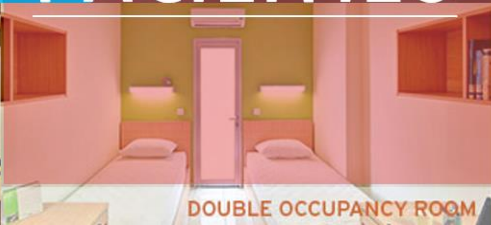
DOUBLE OCCUPANCY ROOM